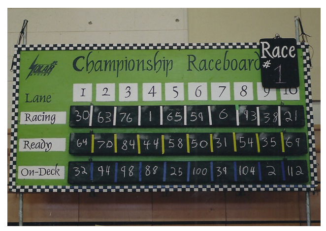
A race board indicating which cars are "racing," "ready," and "on-deck" will be helpful in keeping your races running smoothly.

the same lane. Also, mix up the cars comprising a heat so that they do not race against the same cars every race. (Check Appendix H for Rounds Sheet.)