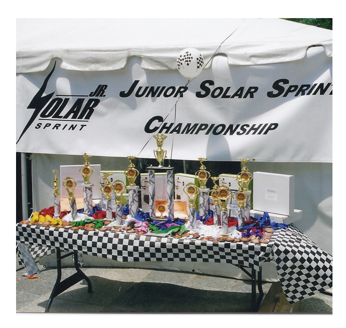
A highlight of the day for many students will be the recognition they receive at the Awards Ceremony where tropies are awarded.