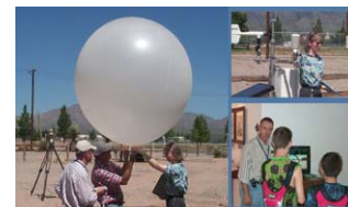
ARL Scientists demonstrate weather instruments to a student group

* Be sure to select the ARL-WSMR GEMS Location when registering on-line